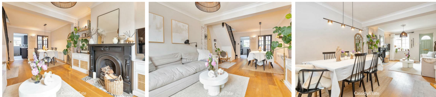
Ground Floor Approx. 357.9 sq. feet

Cassidy & Tate are pleased to present this attractive two bedroom, two reception room mid-terrace property, located in the heart of the conservation area with the advantage of a converted loft room. This pretty cottage has a blend of character and contemporary fixtures as you step inside with accommodation arranged over three floors. The ground floor comprises living room, dining room and kitchen. To the first floor you will find two double bedrooms and a trendy four-piece bathroom. A useful loft room can be found on the third floor with new velux windows. To the outside is a lovely low maintenance decked area with a spacious garden office. Bardwell Road is a sought after address, conveniently located for ease of access to the city centre, historical attractions, restaurants and bars as well as the Thameslink mainline station.